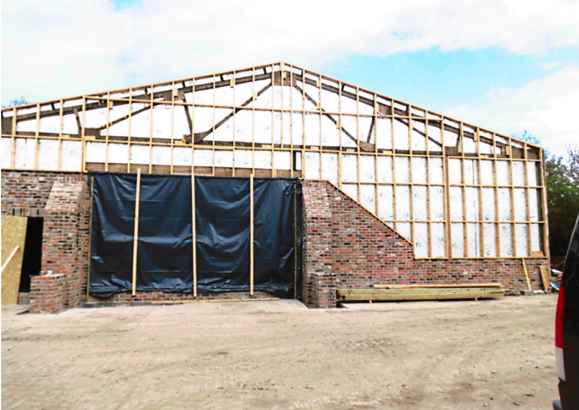
South Elevation of the Venue Building