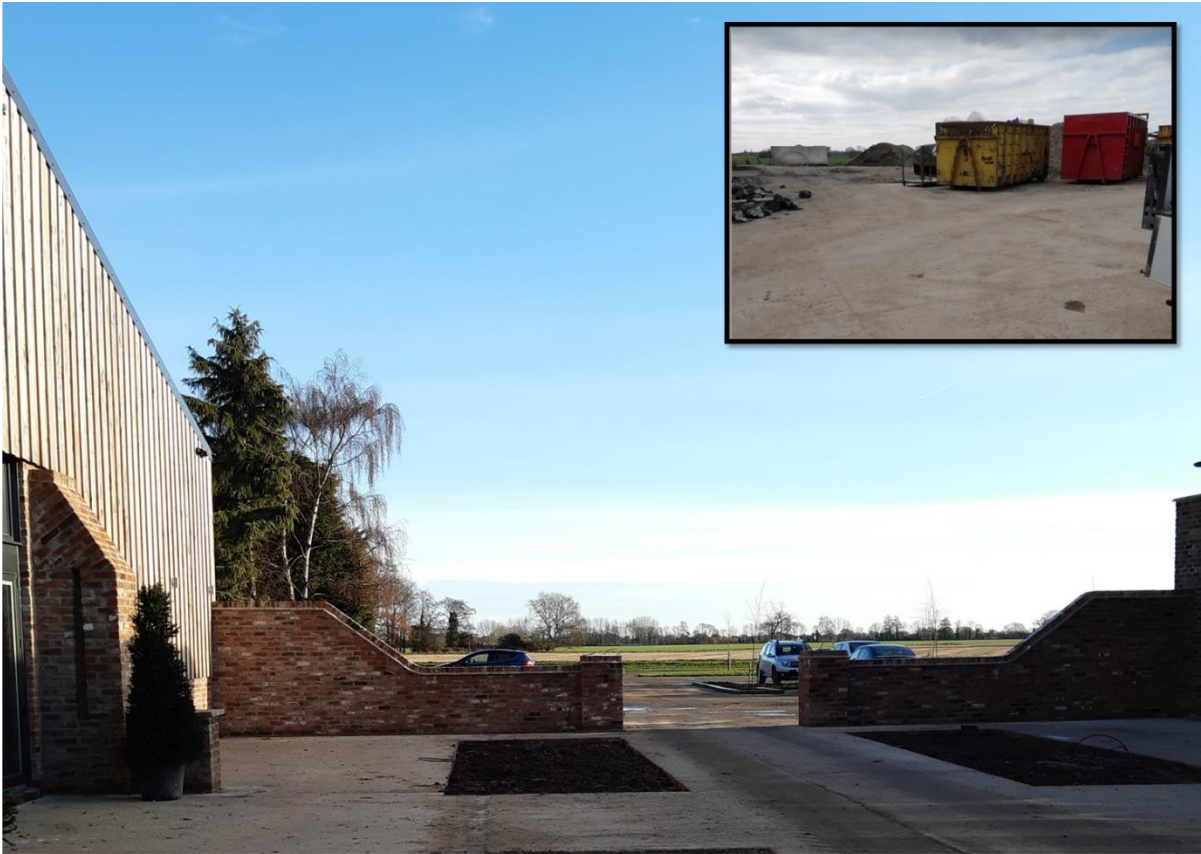
View looking East over the location of the proposed car park