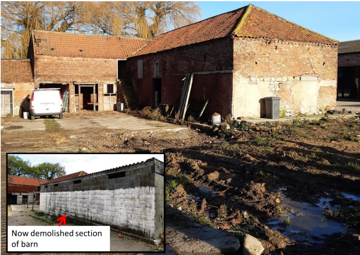
View of the existing building to be used as the accommodation block