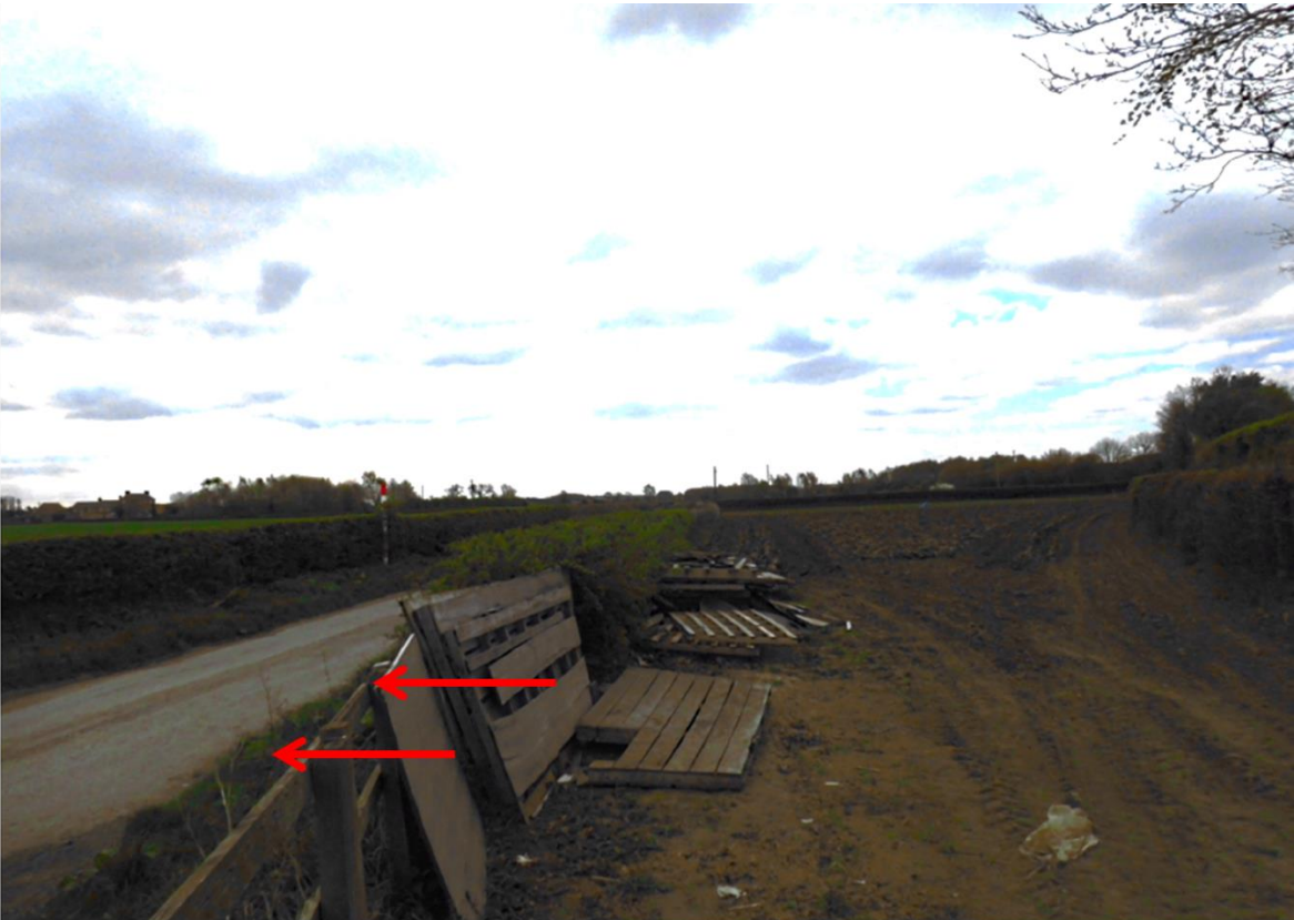
Image of part of the access track