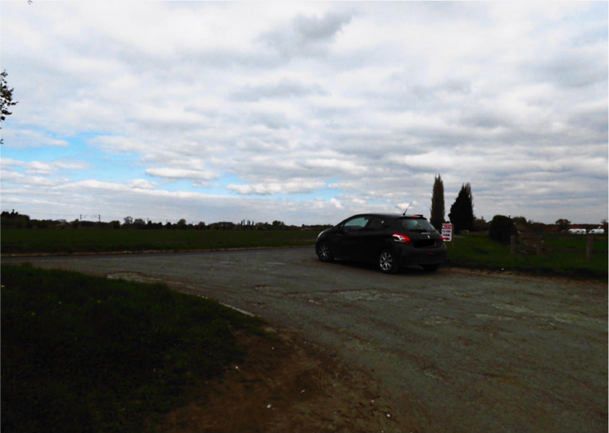
View of the access on to Moor Lane